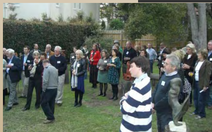
Visitors in the Sculpture Garden