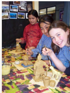
'Clay for Kids' students