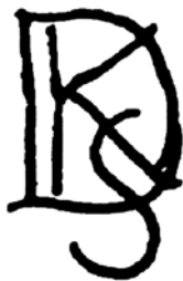
The Duldig Studio